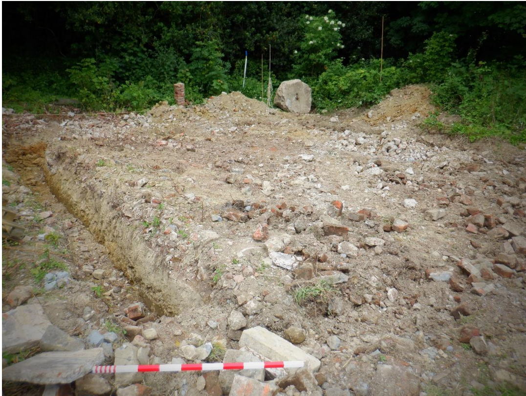
Plate 3. Trenching (looking NNE)