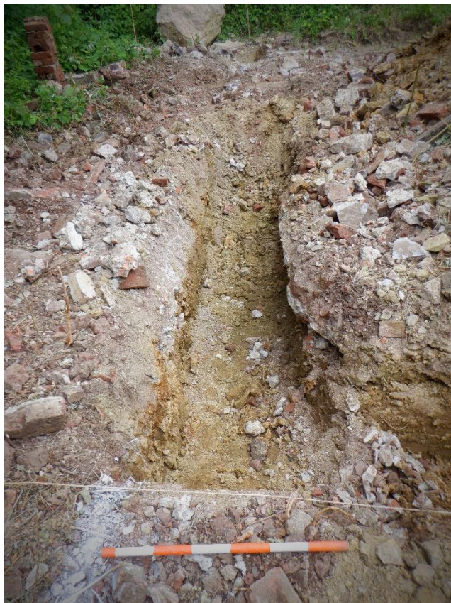
Plate 4. Foundation trenches (looking North)