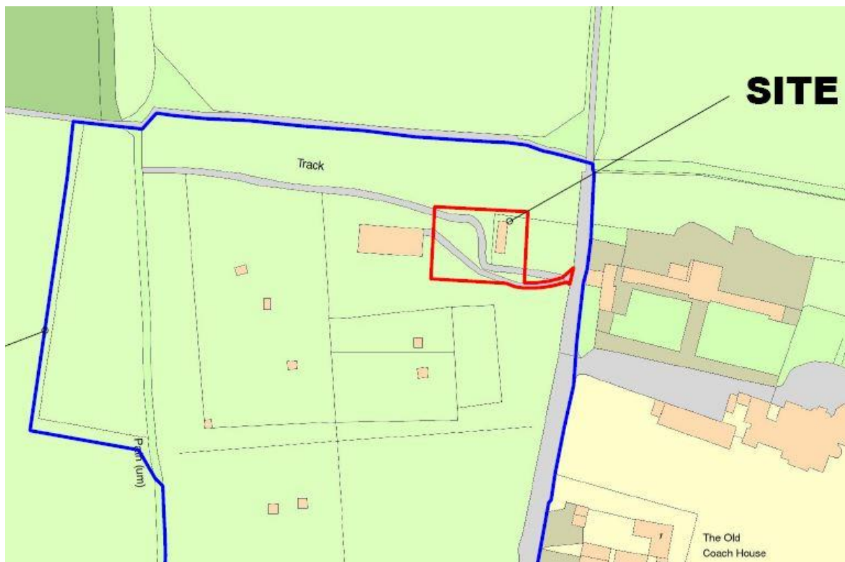
Figure 2. OS plan of proposed area of development (red line))