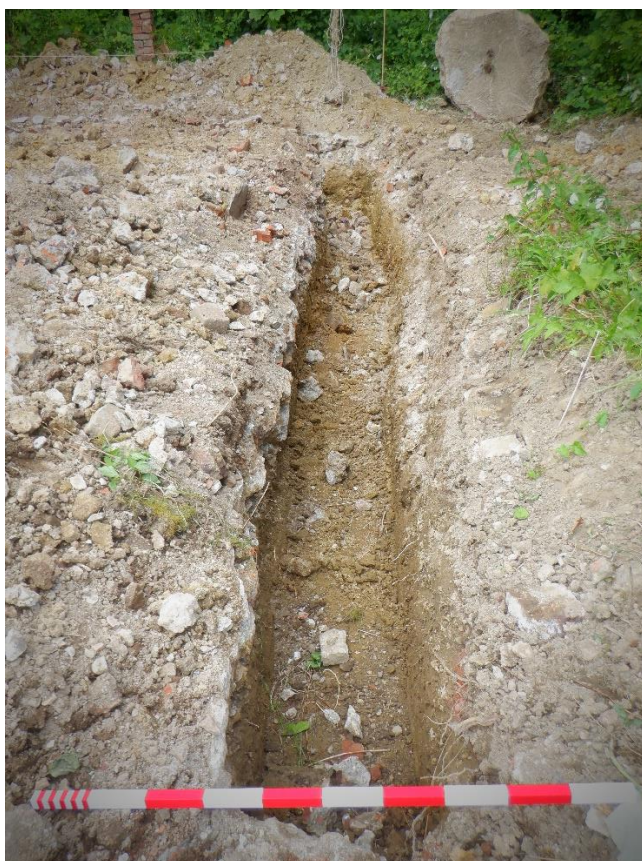
Plate 2. Trenching (looking NNE)