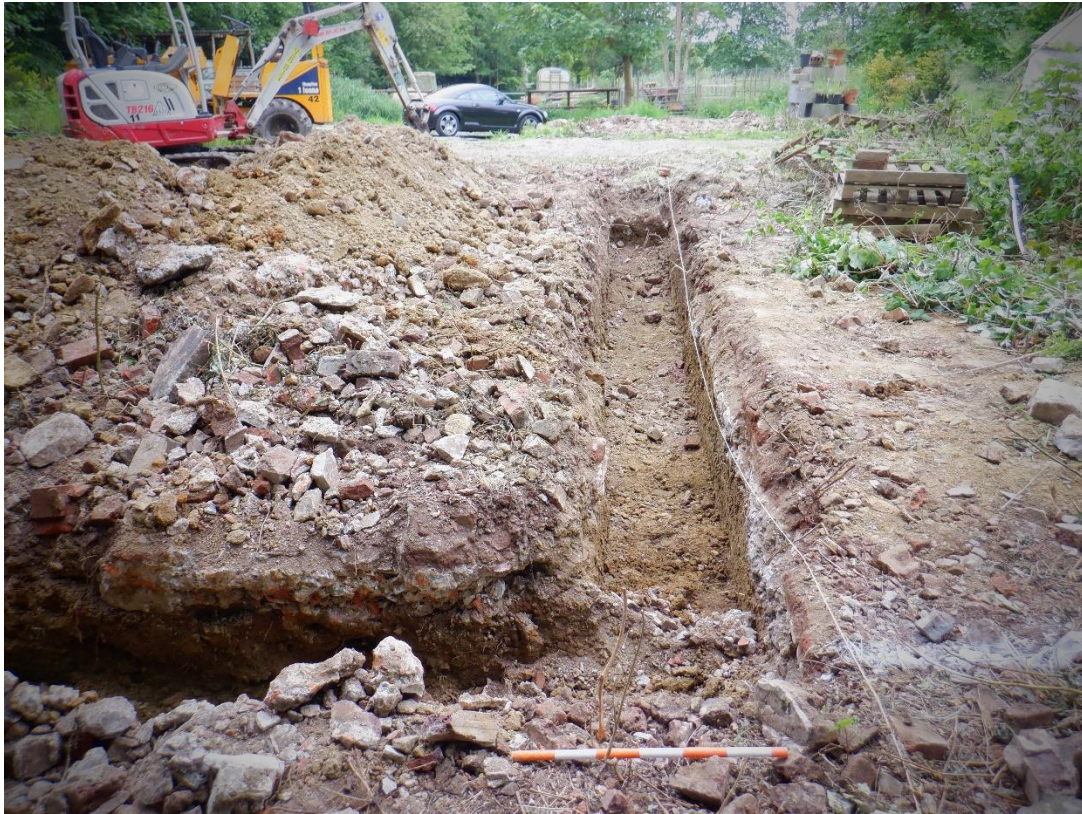
Plate 5. Foundation trenches (looking South)