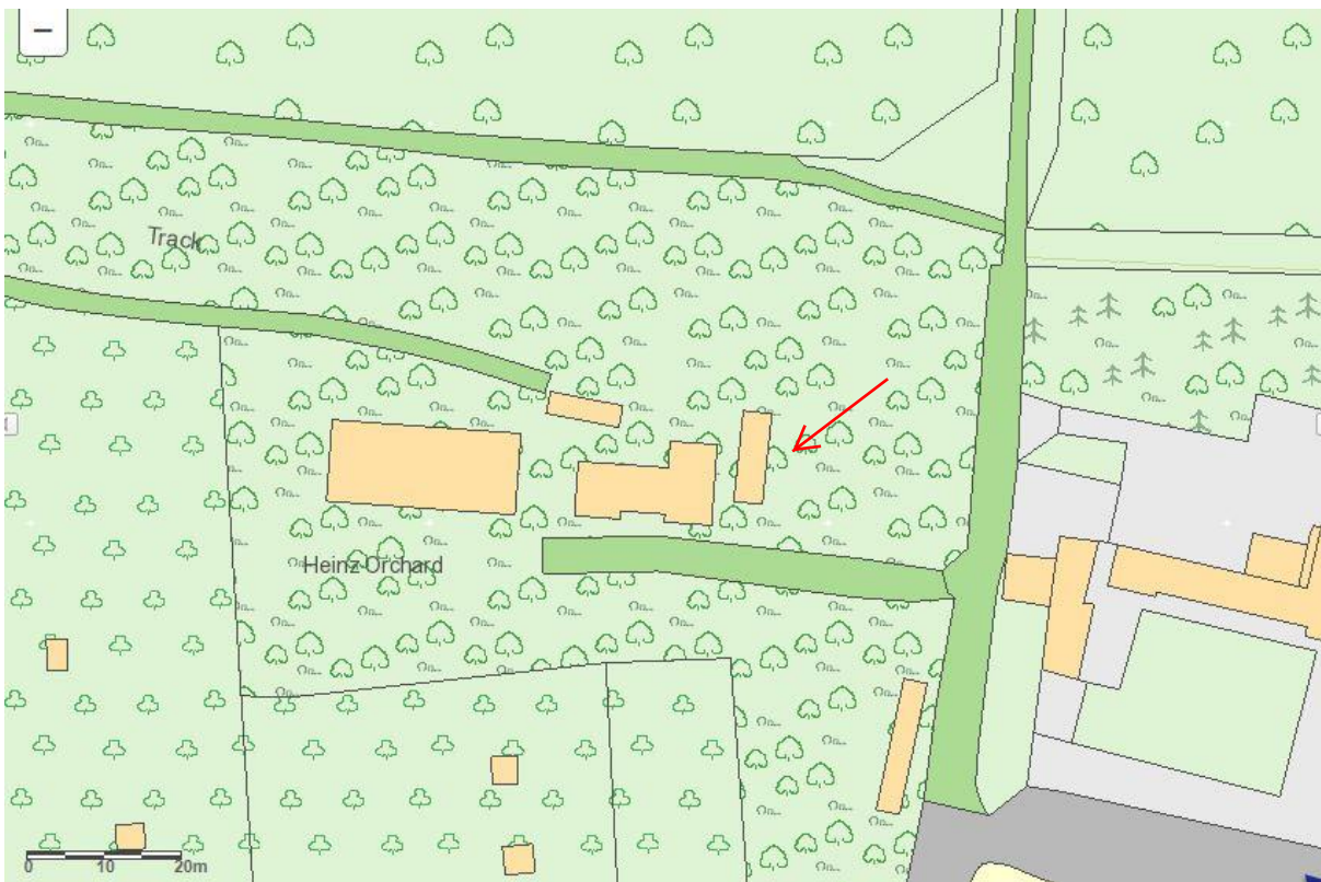
Figure 1. KCCHER map of site location at NGR 578021 149963 (red arrow)