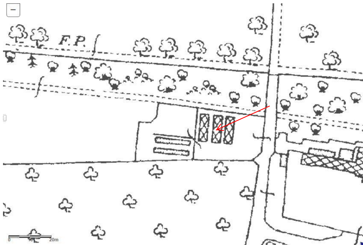
MAP 1. Area in 1929 and area of redevelopment- red arrow